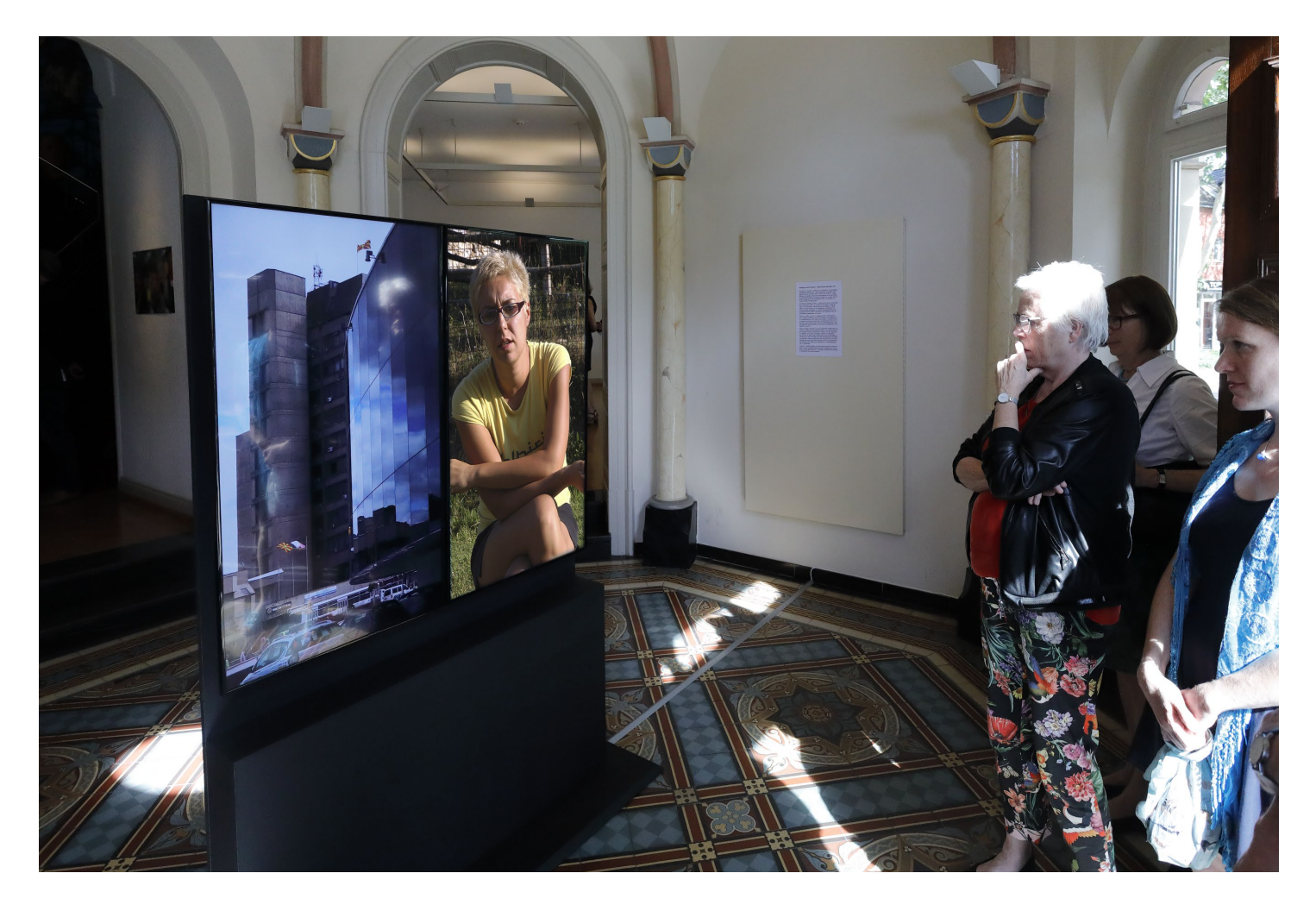
FROM ARTCOLONY GALICHNIK WITH LOVE, 2011, 2 channel video installation (2 screens in portrait format)