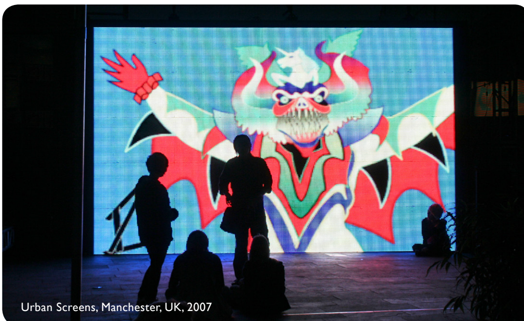
Urban Screens, Manchester, UK, 2007